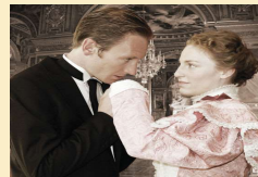
Figure 2. House of Mirth