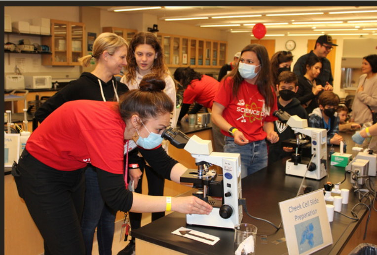
Science in Our Community Event 2022

Another service opportunity provided by our office is to give back to the United Samaritans Foundation (USF) at their Annual Legacy of Hope Fundraiser. Each year Stan State has about 200 students, staff, and faculty volunteer to help facilitate and staff the fundraising gala by assisting with event set-up, customer service at event, and event clean up. Through these efforts USF receives the annual funding necessary to keep providing food for the Stanislaus County via food trucks and emergency food box days (including the campus food boxes) that serve over 314,000 meals each year. Our students, faculty and staff help make this a successful event while serving the community.