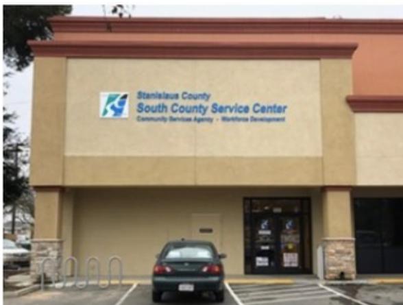
Turlock Office Pictured Above

Community Services Agency serves our community by protecting children and adults and assisting families towards independence and self-sufficiency.