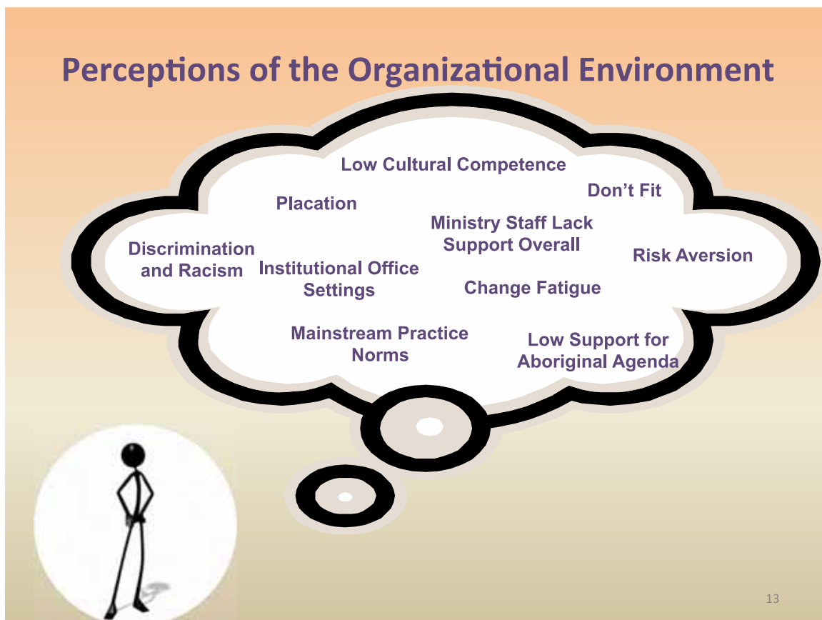
Figure 2 Perceptions of the organizational environment

The following conceptual map visually illustrates the prevailing themes that resulted from participant descriptions of organizational support for their practice within the MCFD organizational environment.