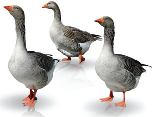
a few of the University's own lawn maintenance custodians