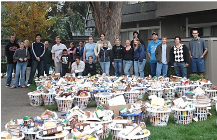
Members of the new University club A Day of Hope gather in front of the Thanksgiving food baskets collected for the needy at CSU Stanislaus.