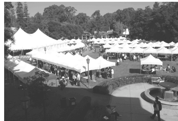
Recruiter Fair at Mills College in October 2006

The Forum does not cover such professional fields as medicine, optometry, dentistry, chiropractic, pharmacy, veterinary medicine, and law.