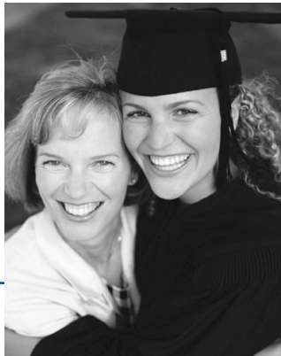
Scholarship recipients are honored at our Annual Fall Awards Breakfast

Recipients of the scholarship will be notified by telephone and/or mail. Additionally, they will be invited to attend the Christian Public Servants Annual Fall Awards Breakfast to be recognized for their achievement.